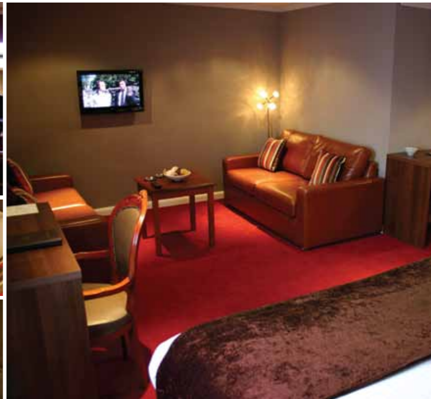
Standard (top) and Deluxe Rooms