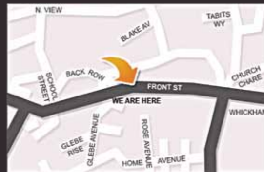
Whickham Street Map