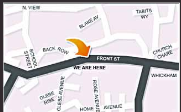
Whickham Street Map